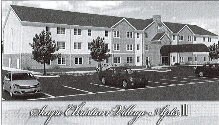
Artist's rendering of new apartments to open in 2009.

In the beginning, fifteen men met to formulate a program devoted to the area of benevolence. Sensitive to the fact that there was not a single Christian Home for the aged in the Central Kentucky area, these men began an organization named Christian Benevolent Outreach in 1973. Their dream was the development of a non-profit retirement village that provided continuous care in a Christian atmosphere.