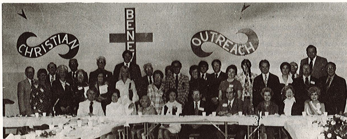
CBO Officers, Directors and Wives, plus Honored Guests at the Chapter Leaders' Appreciation Dinner, Lafayette H.S. Cafeteria, Sept. 18, 1975.

Needless to say this made the whole day bright!